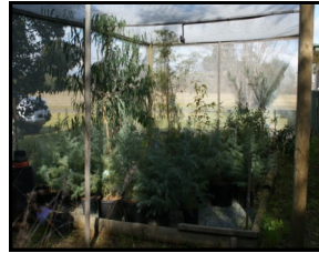
Our Plant Nursery