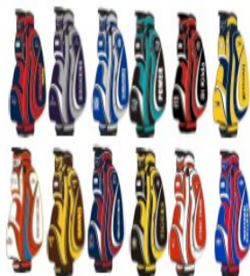
AFL TEAM BAGS AVAILABLE FROM NOVEMBER

PRE ORDER NOW AND RECEIVE A FREE CLUB TOWEL VALUED AT $29.95